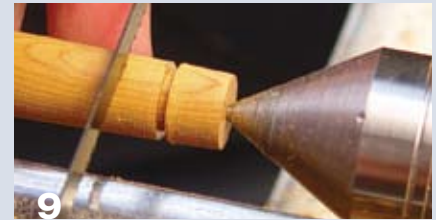
Locate the slot for the clip with a small saw that leaves a \frac{1}{32} " kerf.