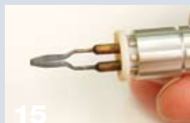
The slotting tool is a Detail-Master No. 2D calligraphy pen.