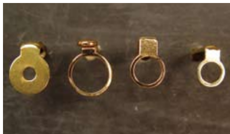
The shape of the clips, left to right: flat washer, large ring, small ring, and the hybrid which is a large ring on its parent kit, but becomes a small ring when used on a larger kit.

Making a pen with an invisible clip allows us to make a one-piece, closed-end cap without leaving the clip in the parts bag, and the result is a pen that has the look of a classic 1950s fountain pen. Also, the weight of the cap is reduced by about half when we throw away the heavy metal in the kit finial.