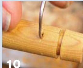
Start the slot with a sharp dental pick.