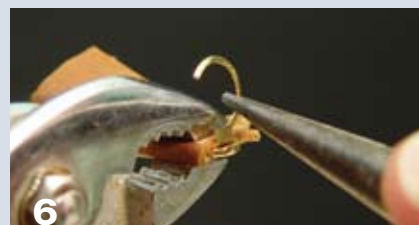
6 Bend the large ring after removing a 90° section. Use two pairs of pliers and hold the clip in a piece of leather to prevent damage to the plating.

If the ring is already smaller than the inside of the tube, the only modification is to remove a 90° section of the ring so it can be threaded into a slot in the barrel ( Photo 4 ). Some large clip rings will become a small ring when they are used with a larger-diameter pen.