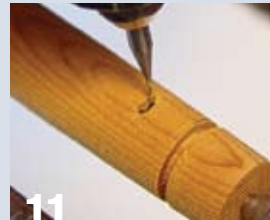
An alternative method is to start the slot with a Dremel tool and a small \frac{1}{32} " or \frac{3}{64} " milling cutter or drill.