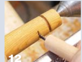
Continue cutting the slot with a small saw blade held in a piece of dowel.