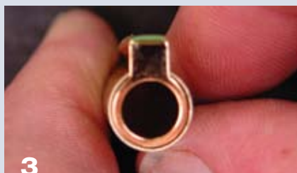
3 Using the brass tube as a sizing gauge, the ring must fit inside of the tube, as the El Grande shown here with the Baron cap tube.