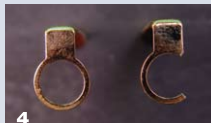
4 If the ring fits inside the cap tube, the only modification is to remove a section of the ring so it may be threaded to the inside of the cap, as with this El Grande clip in a Baron cap tube.