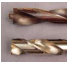
The cap blank is drilled with a \frac{29}{64} " or \frac{15}{32} " drill bit to achieve a square bottom. Use either a pilot point drill bit, or grind a bottoming drill.

A better option is to use a bottoming drill. To make a bottoming drill, first grind the tip of a standard twist drill to a square end. Then, grind no more than 2 or 3 degrees of relief behind the cutting edges ( See photo ).