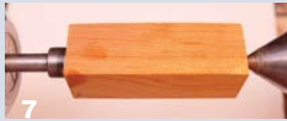
Put the drilled blank on the mandrel and turn to shape. Shown is a blank screw onto a standard 7 mm mandrel that is held in a collet chuck. The tailstock center is just there for additional support, and is not required to drive the blank.