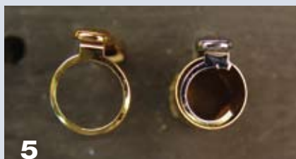
5 If the ring is larger than the tube, it has to be clipped and reshaped until it fits as shown here with the Baron clip in a Baron cap tube.