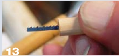
This slot-cutting tool is a piece of a coping saw blade, about \frac{1}{32} " wide.