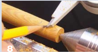
Mark the location of the clip slot and the end of the pen.