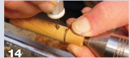
The pyrographic alternative is quicker and more accurate.