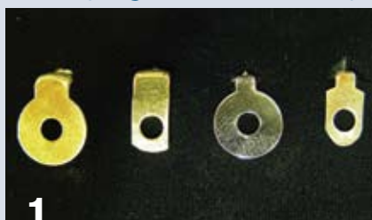
1 Left pair is the clip attachment for the Ameroclassic pen kit and its modification. The right pair is the Berea Perfect-Fit Convertible and a similar modification.